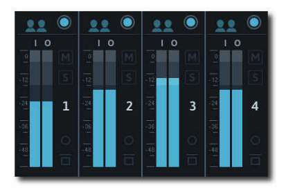
Noise gate off

Once a channel is above the noise gate level, it will count into the AMM algorithm.