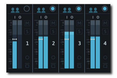
Noise gate on, CH1 is below